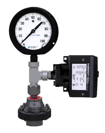
Figure 1 Instrument Assembly with "tee" fitting

To that end, Ashcroft provides instruments mounted on a "tee" fitting (see figure 1), rather than in a goal-post orientation. Doing so allows for weight to be better centered over the diaphragm seal connection port, minimizing the chances of damage during shipping or at a customer's site. It also requires significantly less fill fluid to operate, improving an assembly's thermal error.