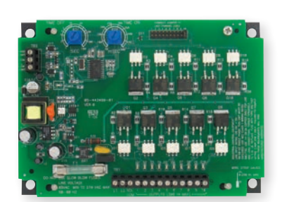
4 thru 10 channel board